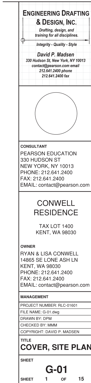
Figure 1–2. A title block found on drawing for a residential construction project.

provides a variety of information about a drawing, such as the title, sheet size, and predominant scale. Figure 1–2 shows an example of a title block. The title and information in a title block tell you immediately if you have the correct map or drawing.